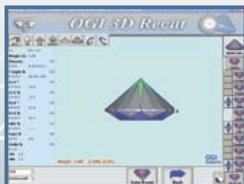
3D Recut (Additional)