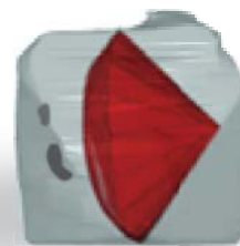
Best Value Planning