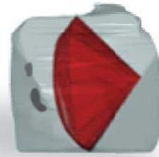
Best Value Planning